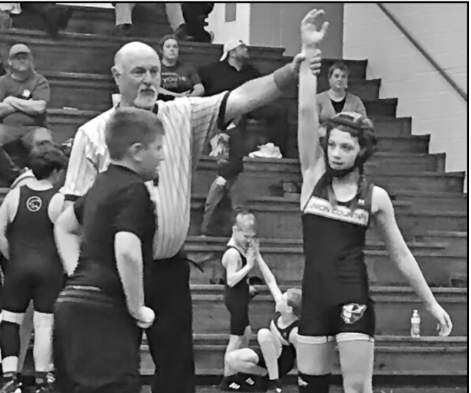
The UCMS grapplers were back on the home mat for the second time this season, scoring a pair of wins in a tri-match vs. Clear Creek and Rabun County. The Panthers edged Clear Creek (49-48) with Union winning on criteria following the last match. Union thumped Rabun 56-33.