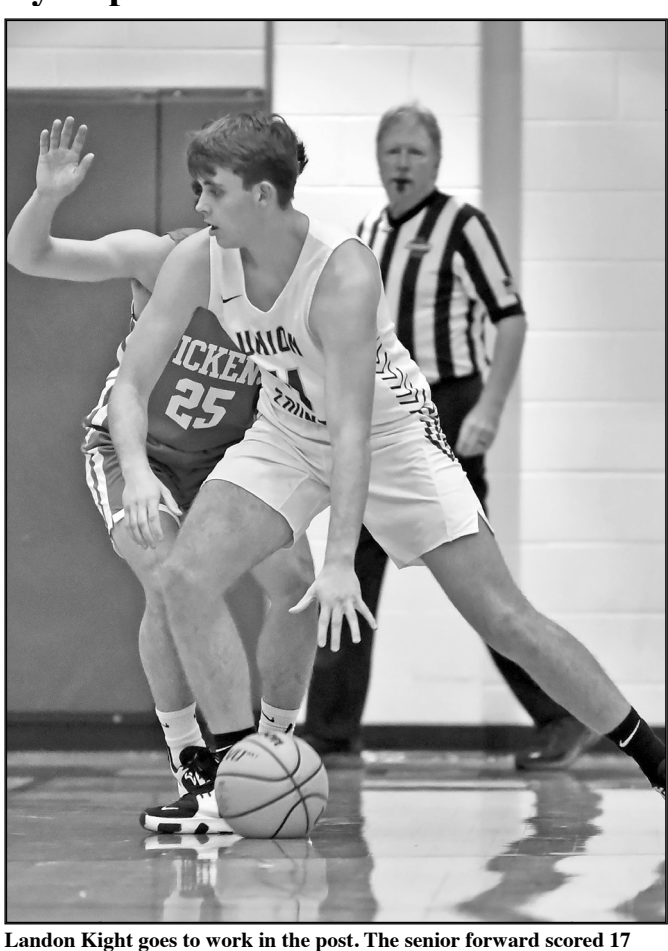
points and pulled down 8 rebounds while shooting 80% from the floor in the win over Habersham Central. pair with 5:24 left in the third.

Turner hit two free throws 16-13 just 4/ seconds into the